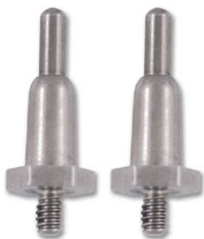
17884 Spring Contacts - PK 2