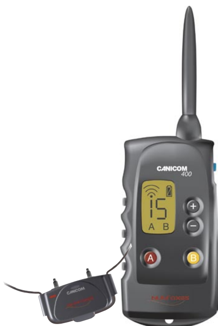
17867 K-400 Remote Trainer (2 Dog Capable)