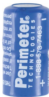
17855 Receiver Collar Replacement Battery