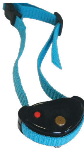
17873 K-SPRAY Bark Collar