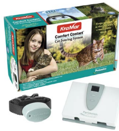
17852 Comfort Contact Cat Fencing System