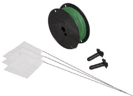
17853 Boundary Kit