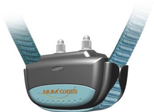
17870 K-PULSE Bark Collar

Internationally accepted bark control systems which help facilitate modern training practices. Designed and manufactured in France for KraMar by Numaxes.