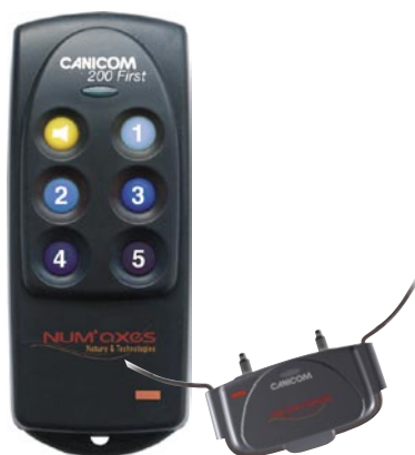
17865 K-FIRST Remote Trainer

KraMar Remote Training Systems are ideal for correcting unwanted behaviour and allow you to train your dog from a distance while off-lead. Designed and manufactured in France for KraMar by Numaxes.