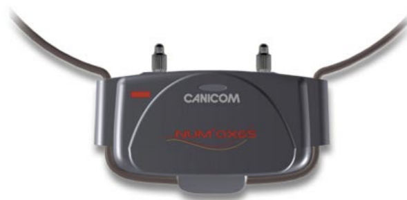
17868 K-COM Additional Receiver Collar