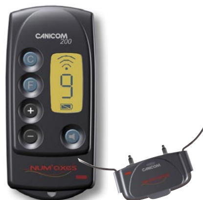
17866 K-200 Remote Trainer