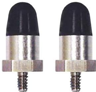
17880 Comfort Contacts - Short - PK 2 17881 Comfort Contacts - Medium - PK 2 17882 Comfort Contacts - Long - PK 2