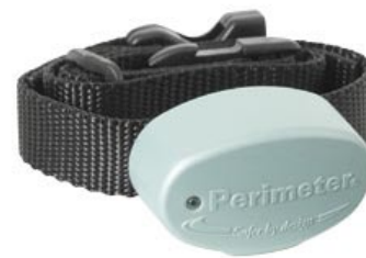
17854 Additional Receiver Collar