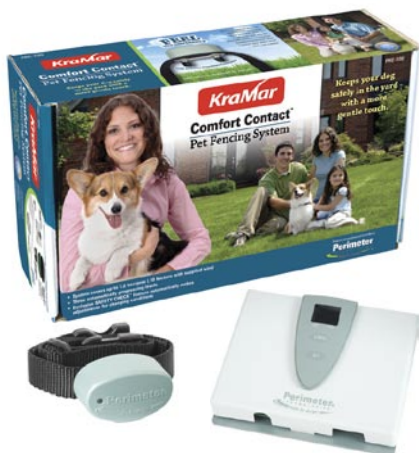
17850 Comfort Contact Pet Fencing System

The KraMar Comfort Contact Pet Fencing Systems come with all the features you need to keep your dog happy and safe at home. Designed and manufactured in USA for KraMar by Perimeter Technologies.