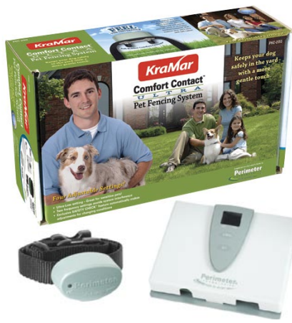
17851 Comfort Contact Ultra Pet Fencing System